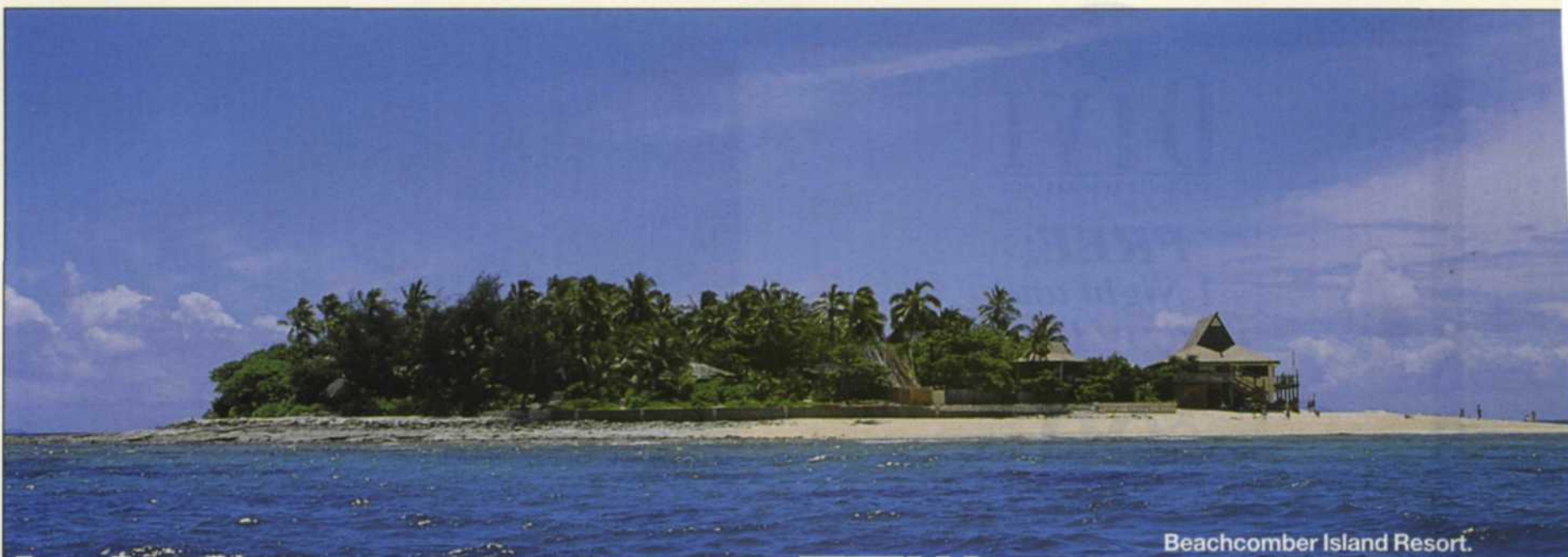
Beachcomber Island Resort.