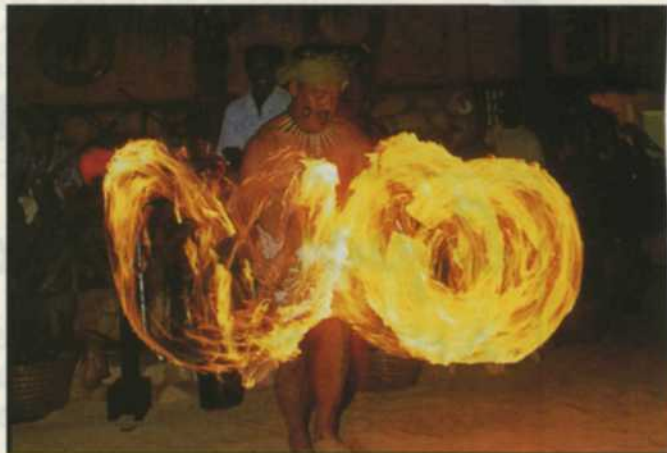
Top: Forster's Hawkfish ( Paracirrhites forsteri ) in hard corals. Above: Eerie swirls of fire are frozen mid-motion during a display of Fijian style dancing.

Mamanucas. This 300 acre island paradise features 70 beachfront bures (Fijian inspired cottages) and 90 tropical garden bures designed to fit all budgets. There are several restaurants with traditional and Fijian meals guaranteed to tantalize your taste buds.