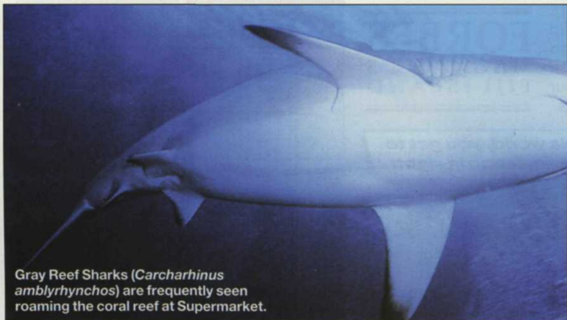
Gray Reef Sharks ( Carcharhinus amblyrhynchos ) are frequently seen roaming the coral reef at Supermarket.

Of course, the most important watersport—scuba diving—is a main activity at Mana Resort. The full service dive op-