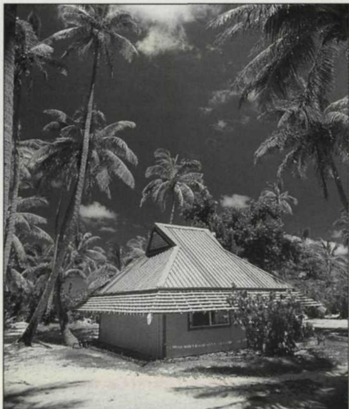
Above: A Fijian influenced bure at Mana Island Resort. Above right: With canoes and other watertoys there is always plenty to do at Beachcomber Island Resort.

Their proximity to Nadi International Airport makes the Western Islands a great vacation getaway. Warm weather, friendly people, good diving and water-sports galore are all the elements necessary for Fijian fun in the sun. 🐠